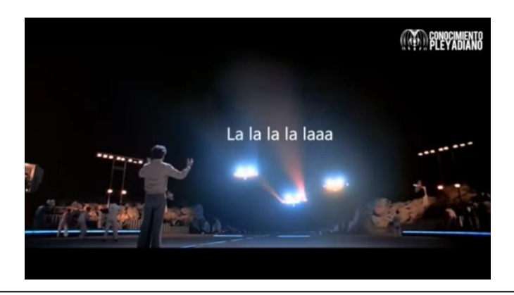
Film fragment Close encounters of the third kind

Anéeka of Temmer : In Taygeta we tend to try to solve a mathematical problem using musical tones imagined in the mind, or vice versa. For example, the target frequency of a spaceship is represented by a mathematical number, but it can and is stored many times as a series of musical tones, meaning that, the direction of the Earth or anywhere else is represented by a tune, not with cold numbers. This is not fiction, it is what I am telling you here today.