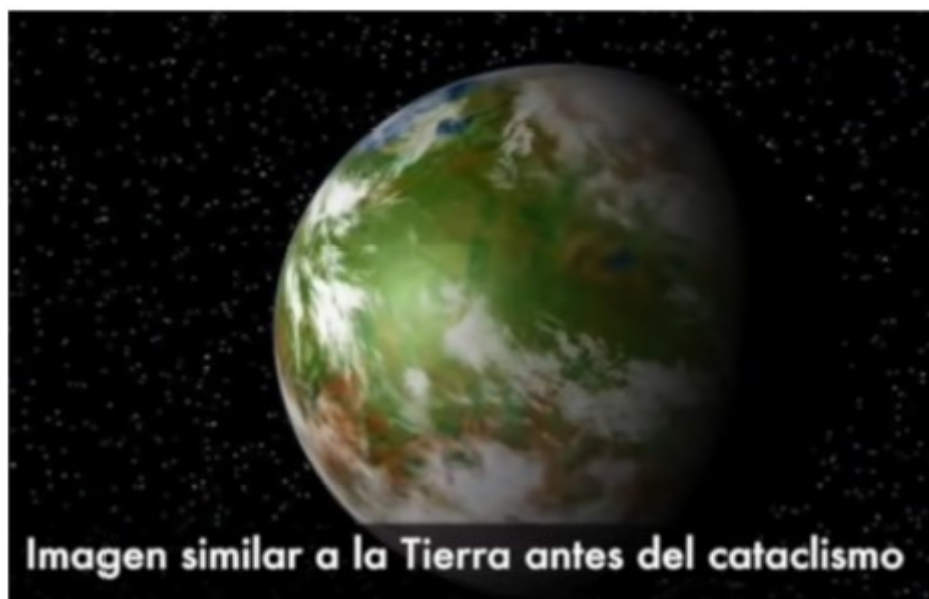
Image similar to Earth before the flood

So, as Tiamat was a fairly large sea planet, its water floated through space for some time. It's not clear to me how long, but not much. A few years, maybe decades, at the most. Until much of that water was trapped by Earth's gravity and Venus's too a little later. And it entered both planets like water falling from the sky in torrential quantities, creating the Universal Flood of which virtually all cultures with ancient records on Earth speak of, drowning and destroying almost the entire surface of the Earth and Venus, and every civilization that was there.