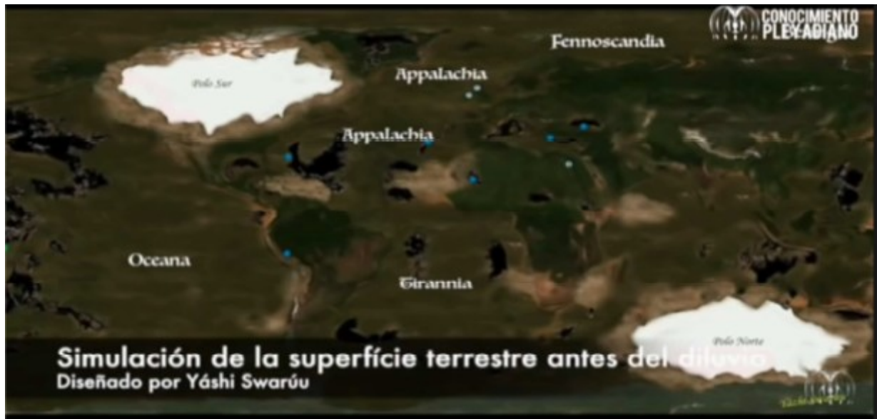
Simulation of Earth's surface before the deluge

So, as so much mass of water enters planet Earth, it completely changes the delicate geological and energetic dynamics of the planet itself because it is like a Dynamo or electromagnetic generator, creating a flow due to the high amount of ferrous magnetic material in the magma. Then, the rotation is affected, and with the rotation, the dynamics of formation of the magnetosphere because a planet needs a certain rotation or internal currents to generate its electromagnetism. That is, its spin and the internal movements of the magma in relation to other magma layers inside the Earth, are what create a dynamo effect that the magnetosphere generates. Interestingly, the same principle as a spacecraft counter-rotating magnetic turbine. With this change, in addition to the cataclysm caused by the flood, when the energy dynamics of the planet are affected, it causes a sliding or movement of the poles, thus creating an inversion of planetary polarities with its subsequent consequences, devastating for all life and biology, even for the shape of the terrain itself.